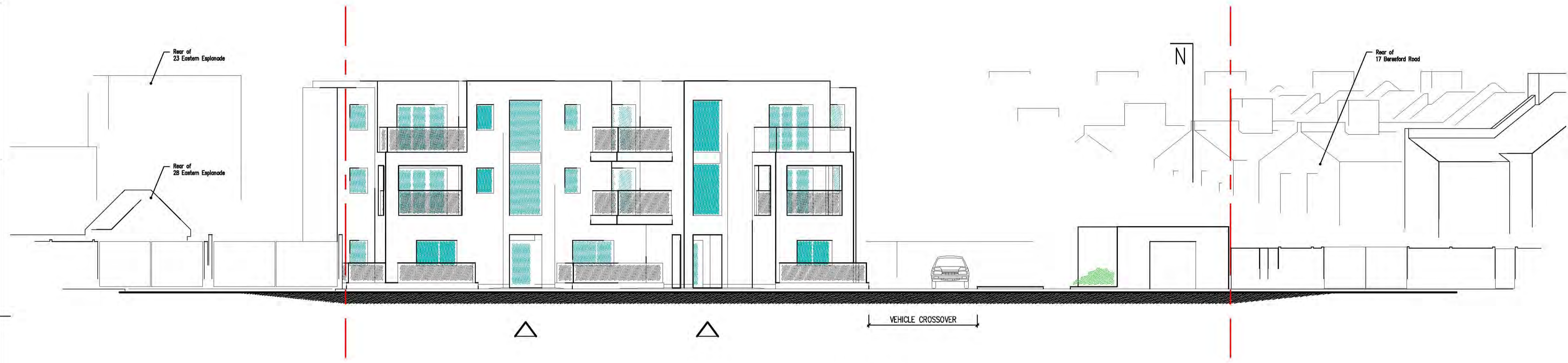
PROPOSED FRONT ELEVATION (EAST) Burdett Road Streetscene